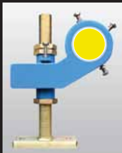
Torsion Mount: Self Adjusting